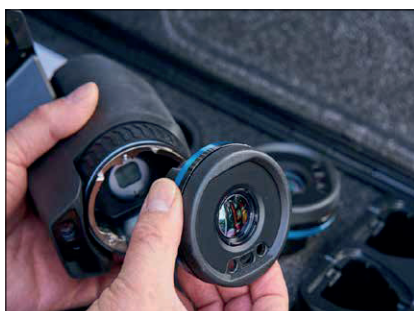
Share lenses (wide angle to telephoto) across your fleet of cameras thanks to AutoCal™ optics