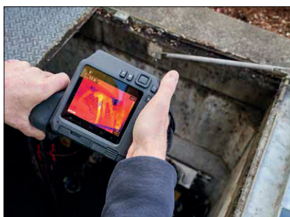
Up to 161,472 pixel resolution for accurate readings on distant targets