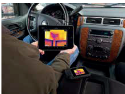
Upload images to FLIR Tools over Wi-Fi