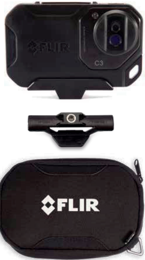
FLIR C3 with Tripod Mount & Carry Pouch

Specifications are subject to change without notice.