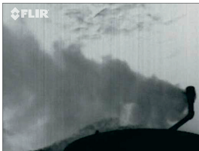
Venting pressure relief valve on storage tank